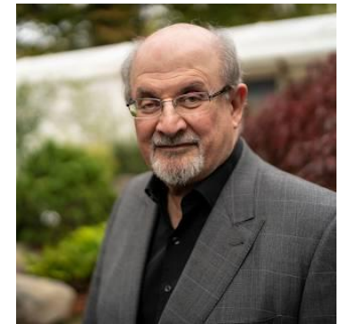
Salman Rushdie - Writer