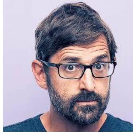
Louis Theroux - Journalist