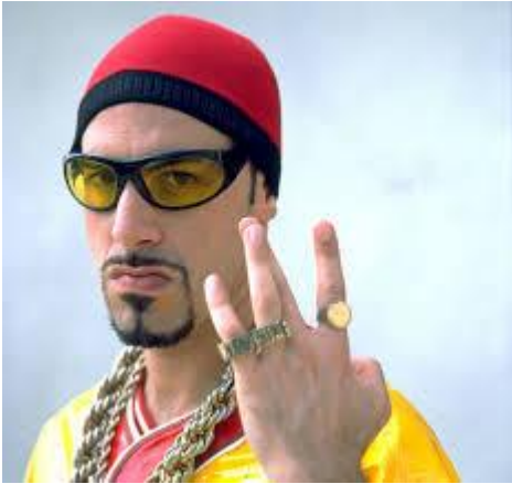
Sacha Baron Cohen (Ali G) - Actor/Comedian