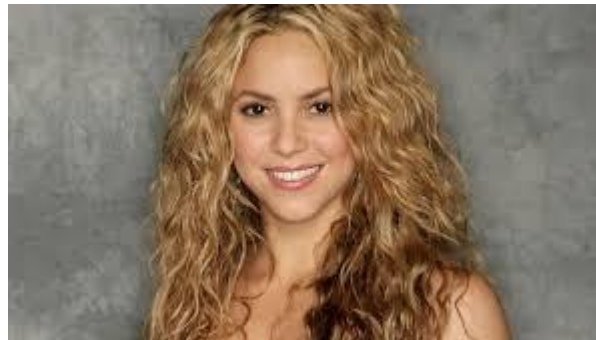
Shakira - Singer