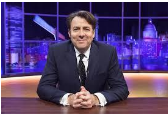
Johnathon Ross- TV Presenter