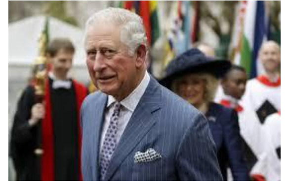
King Charles - Monarch